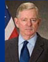
W. Ralph Basham Commissioner