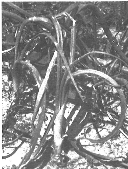
Fig. 1. Symptoms of onion twister disease occurring naturally on a 12-wk-old onion (cv. Round Red). Note the curling and twisting of leaves and the abnormally elongated neck.

Conidia were removed from acervuli on onions collected in the field, streaked on potato-dextrose agar containing 1% streptomycin (PDAS), and incubated at 27 C for 20 hr. Colonies derived from single spores were transferred to fresh PDAS.