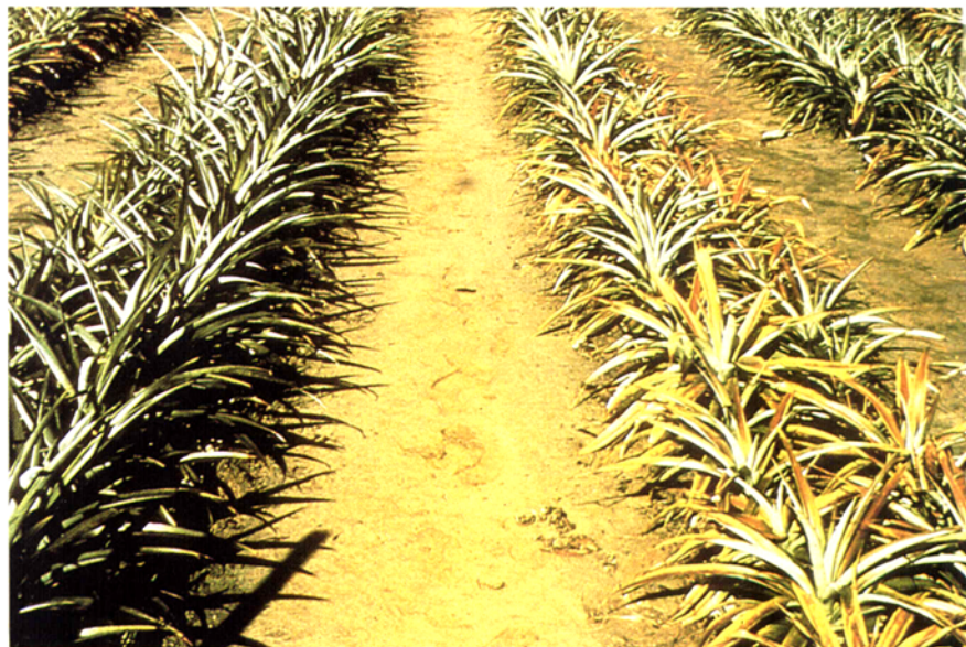
Fig. 2. Pineapple heart and root rot, caused by Phytophthora cinnamomi , controlled (left row) by 1,200 kg/ha of sulfur disked into the infested soil.

Disease absent but pathogen present. Phytophthora root rot of avocado. A 1969 request to Australian nurserymen for information concerning situations where disease did not occur even though the environment was very favorable and surrounding plantings sustained severe losses disclosed the Ashburner avocado grove on Tamborine Mountain in Queensland. Phytophthora cinnamomi had established in the soil, but root rot of this highly susceptible crop was very rare. The soil was still suppressive after aerated