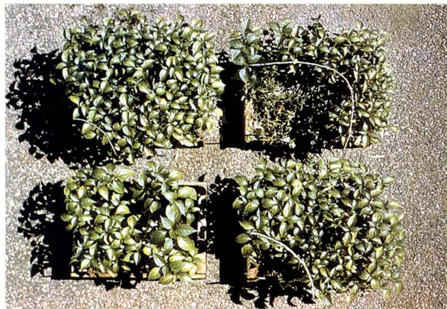
Fig. 4. Effects of different aerated steam heat treatments on natural soil inoculated with Rhizoctonia solani and planted to peppers. Inoculum was placed in lower left corner of each flat at the time of seeding. (Lower left) Not steamed, (upper left) steamed at 60 C for 30 minutes, (lower right) steamed at 71 C for 30 minutes, and (upper right) steamed at 100 C for 30 minutes. Disease severity increased progressively as more antagonists were killed by higher temperatures. The reduced stand in the untreated flat (lower left) resulted from damping-off by a resident Pythium sp. A flat treated at 100 C for 30 minutes but not inoculated with R. solani was similar to the flat steamed at 60 C for 30 minutes (upper left).

No signs of biocontrol. Biocontrol agents are in most soils and probably in water and air, usually without producing