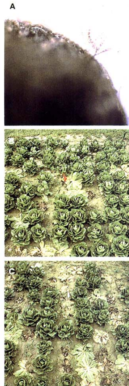
Fig. 5. Biocontrol of lettuce drop, caused by Sclerotinia minor , with sclerotial parasitism by the mycoparasite Sporidesmium sclerotivorum . (A) Sporulation of S. sclerotivorum on a sclerotium of S. minor . (B) Lettuce drop at first lettuce crop harvest 1 year after applying 1,000 S. sclerotivorum spores per gram of soil to S. minor -infested plot. (C) Control plot without S. sclerotivorum .