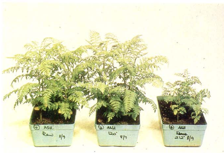
Fig. 1. Biological suppressiveness of a Queensland avocado grove soil to Phytophthora cinnamomi by selective steam treatments. (Left) Untreated soil, (center) soil treated with aerated steam at 60 C for 30 minutes, and (right) soil treated with aerated steam at 100 C for 30 minutes. Each flat was then inoculated with P. cinnamomi and seeded to susceptible jacaranda. Plants are shown after 4 months at 23.5 C.

A prerequisite to detecting biological disease suppression is knowledge of the biology of the pathogen and the disease it