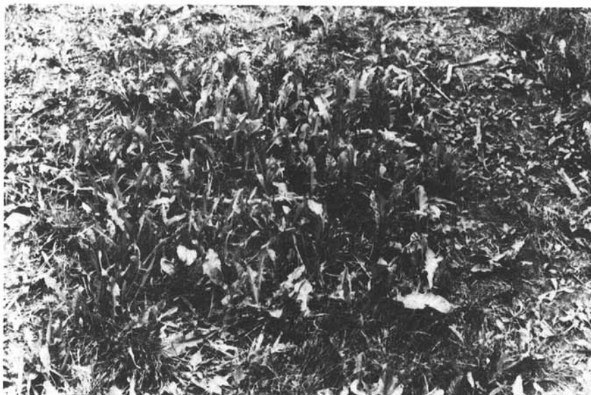
Fig. 1. Replacement of Festuca rubra (foreground) by Taraxacum officinale associated with the presence of medium to high population levels of Meloidogyne microtyla in an apple orchard soil.

The other nematode species present were not considered to have played a major role in the drastic decline in the fescue cover crop, because their numbers were not sufficiently large or they were not known to be detrimental to grasses. The large number of pin nematodes,