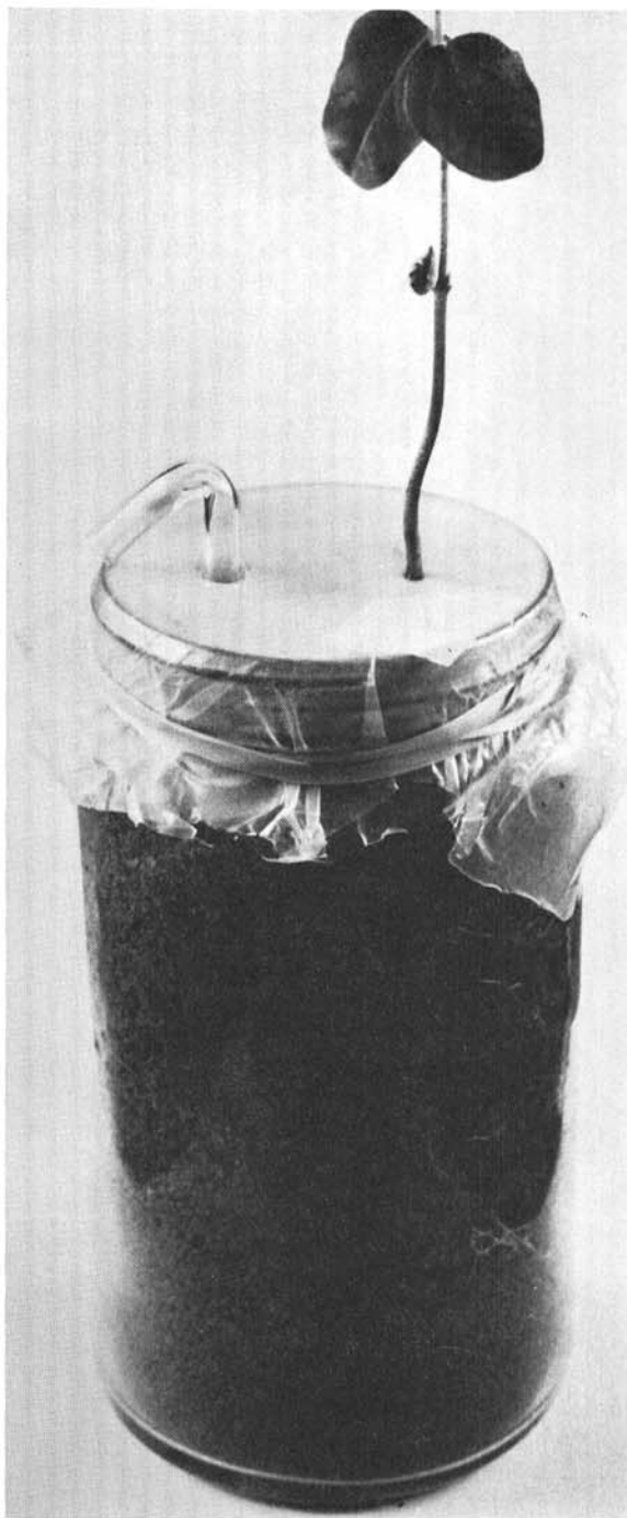
Fig. 1. Soybean plant supporting monoxenic culture of Endogone on its root system.

The method of culturing soybean with a sterile root system is illustrated in Fig. 1. Wide-top glass jars (475 ml) were filled with screened soil and autoclaved for 1 hr on each of 4 successive days. Sterile soil was added to make the soil surface level with the top of each jar. The soil was moistened with sterile water before the jar was covered with two thicknesses of a thin laboratory film (Parafilm M-6). Soybean seed were disinfested with NaClO and germinated on PDA slants to assure freedom from microorganisms. A probe was inserted through the film covering each jar and 3-5 cm into the underlying soil. Thirty to 100 sterilized chlamydospores were injected through the perforation to various depths in the soil with a sterile, 14-gauge, 10-cm laboratory cannula and syringe. The radicle of a germinated seed was then inserted through the film