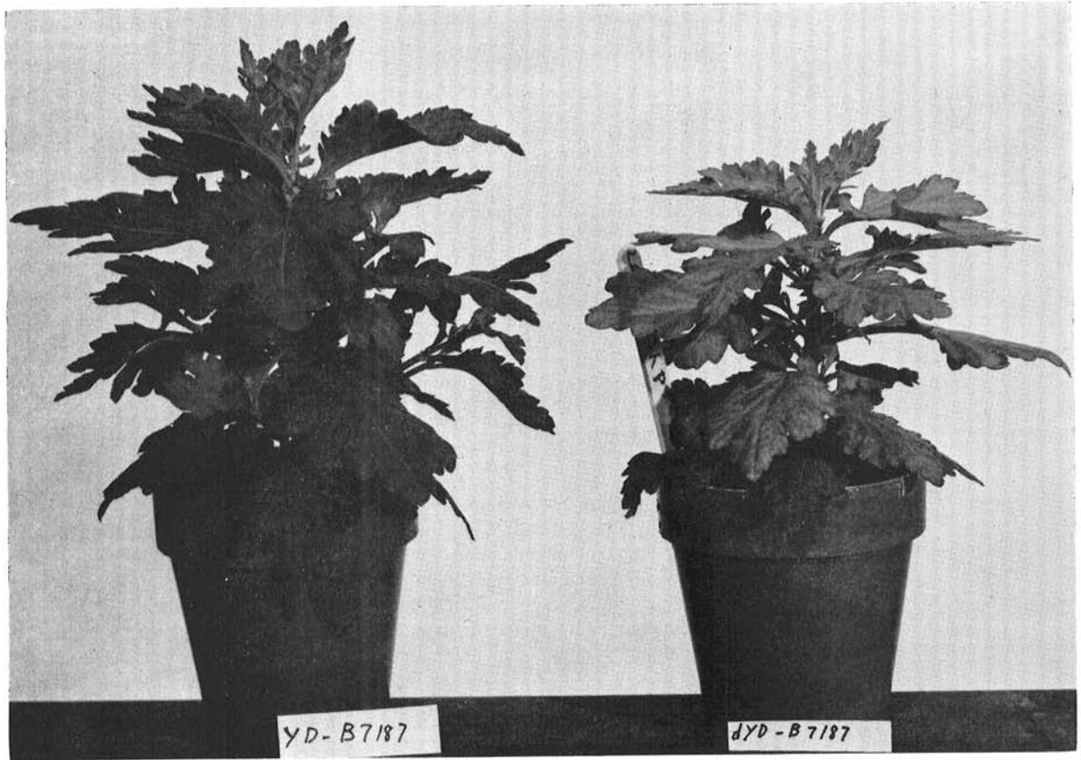
Fig. 1. Yellow Delaware chrysanthemum plants from a commercial glasshouse. (Left) healthy; (right) chlorotic mottle-infected. These plants were removed from a single pot and repotted. Note normal appearance of lowest leaf, mild mottle of next two, and general chlorosis of upper leaves of infected plant. All five plants in the original pot were uniform and appeared normal when planted.

to 12 plants of Chenopodium amaranticolor Coste & Reyn., and in September and October to 6 plants of Petunia hybrida Vilm. 'White Cascade', 17 plants of Nicotiana glutinosa L., 12 plants of N. clevelandii Gray, 8 plants of N. tabacum L. 'Turkish', and 16 plants of Tetragonia expansa Murr. The inoculated plants were retained for at least 4 weeks, but in no case did any local or systemic symptoms indicative of virus transmission develop. Although negative evidence is equivocal, these tests suggest that the diseased chrysanthemums did not carry tobacco mosaic virus, cucumber mosaic virus, chrysanthemum aspermy virus, Noordam's chrysanthemum virus B, or chrysanthemum dwarf-mottle virus—or, alternatively, that the chrysanthemum sap from diseased plants carried virus inhibitors or that the technique was faulty. Previous studies in our laboratory and elsewhere (5) have not indicated the presence of a general virus inhibitor in chrysanthemums that would do more than reduce the number of infection sites. Symptom expression of the above-named virus diseases on these hosts following sap inoculation usually develops within 4 weeks (1, 5, 6):