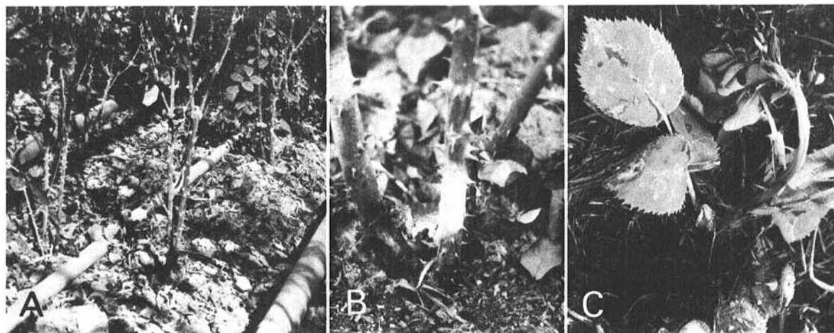
Fig. 3-(A to C). Symptoms of a stem blight of rose caused by Phytophthora megasperma . A) Defoliation of lower leaves of diseased rose plants originated from cuttings. B) Discoloration of stems of the diseased rose plants near the soil surface. C) Wilt of a young shoot and leaves after artificial inoculation under greenhouse conditions.

According to Ito and Nagai (5), the former species differs from the latter in the size, mode, and later formation of sporangia as well as in the absence of oogonia. The sporangia of these two species are 36-53 \mu\text{m} \times 17-36 \mu\text{m} (mostly 46-48 \mu\text{m} \times 24-29 \mu\text{m} ), and 41-84 \mu\text{m} \times 26-48 \mu\text{m} (mostly 60-84 \mu\text{m} \times 29-43 \mu\text{m} ), respectively. Later-formed sporangia (probably secondary sporangia) were produced on the hyphae and proliferated inwardly through the empty preceding ones in both former and