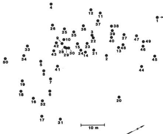
Fig. 1. Map showing the location at Rocky Hill, CT, of 50 American chestnut trees ( Castanea dentata ) that are single stems or multiple sprouts at least 2.5 cm diameter at breast height. Not shown are the many oaks, beeches, and woody shrubs in the plot.

The diversity of v-c types of C. parasitica from Rocky Hill is