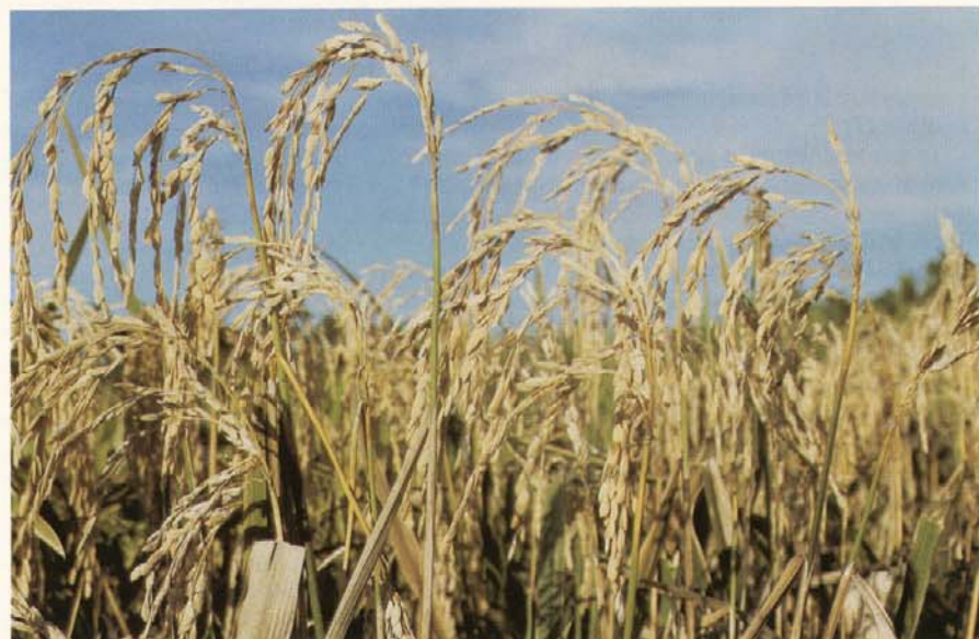
Fig. 4. Severe neck blast in which all panicles are empty.