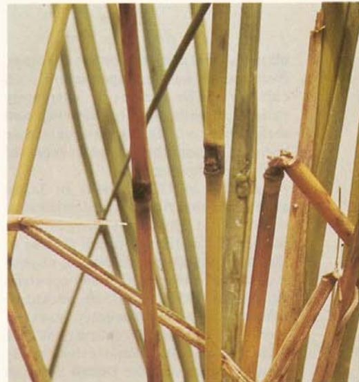
Fig. 5. Infected nodes turn black and break apart with drying up.