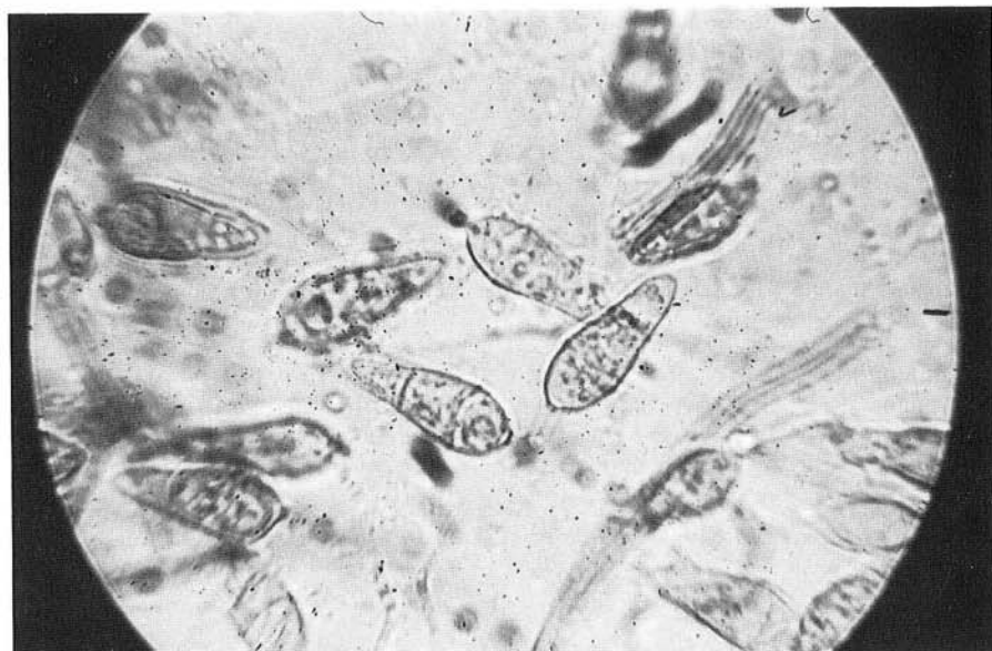
Fig. 6. Conidia of rice blast fungus in culture.