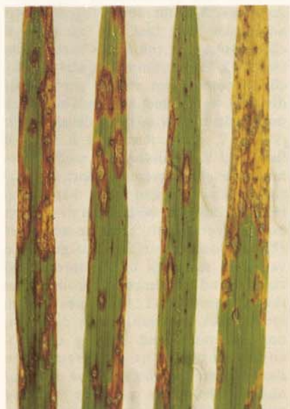
Fig. 2. Leaf spots caused by the rice blast fungus ( Pyricularia oryzae ).

The ideal way to control rice blast would be use of cultivars resistant to the disease. Many countries, including India, Japan, and Taiwan, have been developing