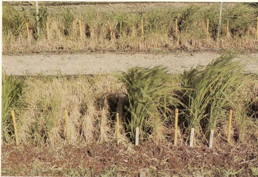
Fig. 9. Susceptible and resistant cultivars in a blast nursery.

spectrum of resistance did not develop. Perhaps the extreme variability of the organism prevented such a buildup, thus establishing stable resistance.