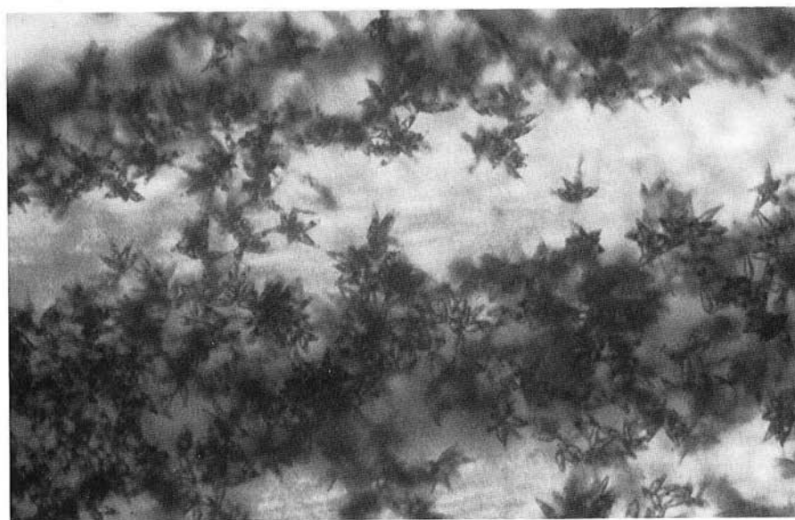
Fig. 7. Clusters of conidia developed on leaf tissue infected with rice blast fungus.

blast-resistant cultivars for 50 yr or more. Each country has developed several such cultivars. The fungus is extremely variable in pathogenicity, however, and each cultivar is useful for a few years, then becomes susceptible as new races of Pyricularia develop.