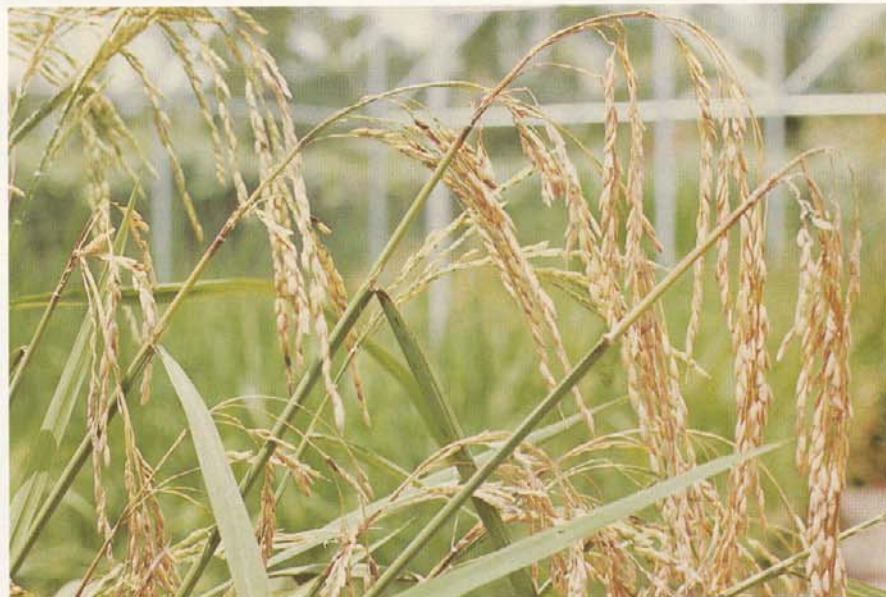
Fig. 3. Rice blast lesions at the base of panicles.