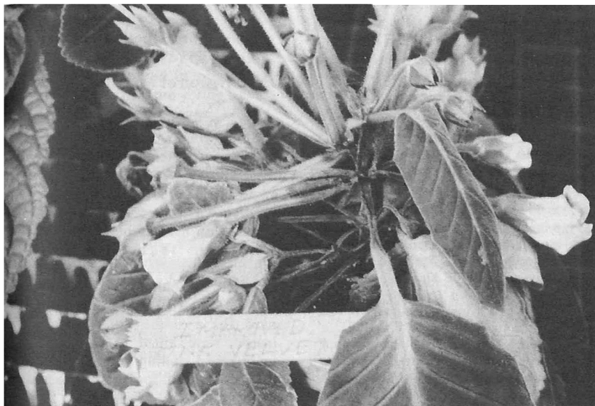
Fig. 1. Crown infection of gloxinia incited by Phytophthora parasitica .