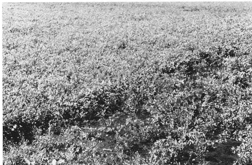
Fig. 5. In an experimental field of alfalfa at Waseca, MN, natural infection by Phytophthora killed many Vernal plants (lower right) but not Agate plants (upper left and right).