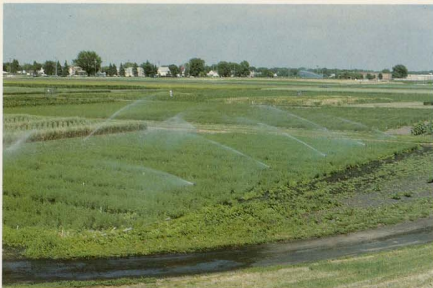
Fig. 2. The Phytophthora root rot nursery at St. Paul, MN, in which many alfalfa breeding lines and cultivars are evaluated each year.