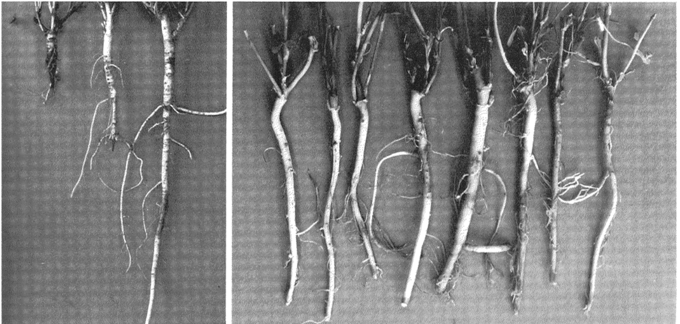
Fig. 1. Phytophthora root rot of alfalfa (left) from the field and (right) from the growth chamber. Lesions occur at various depths and turn from brownish yellow to dark brown or black.

Alfalfa, the most important forage crop in the United States, has been frequently described as not tolerant of wet soils. Almost 70 years ago, Wing (11) described a root rot of alfalfa that he attributed to wet soils or a high water table. He advised farmers to avoid wet soils or to tile-drain wet areas of fields for alfalfa production. Erwin (2,3) described this root rot disease in 1965 and identified the causal agent as a species of Phytophthora that requires free water for infection. Subsequently, Phytophthora