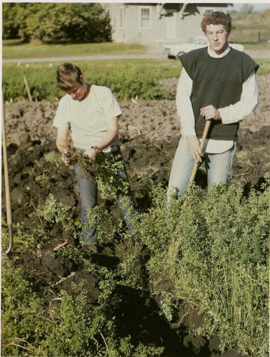
Fig. 3. In the PRR nursery, plants are dug by hand to obtain as much taproot as possible for evaluating reaction to Phytophthora megasperma f. sp. medicaginis .

periods of rainfall or after overirrigation, conditions are favorable for PRR. Established stands may be destroyed during prolonged wet periods. If rainfall is excessive after sowing, stand establishment may fail because of seed and seedling rot. Affected areas range from a few square meters to entire fields.