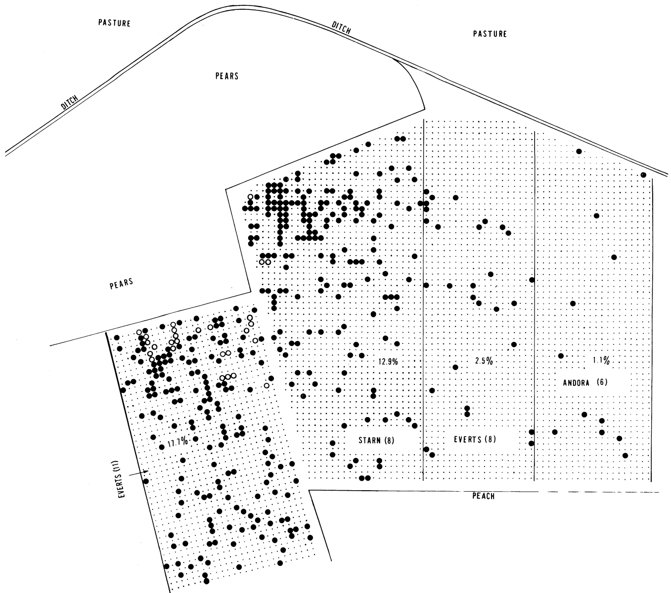
Fig. 3. Peach yellow leaf roll (PYLR) in peach orchards near a Bartlett pear orchard in Yuba County, 1979. Note that the heaviest incidence of PYLR closely follows the irregular border of the pear orchard. Cultivar and tree age, eg, Starn (8), and percent of trees with PYLR are shown in each block of peaches. · = peach trees without PYLR, • = trees with PYLR symptoms, o = recently removed trees.

In orchards several miles from a major river or river floodplain, the concentration of PYLR was greater near pear orchards and generally diminished with increasing distance from pear. Figure 3 depicts a typical example; the heaviest concentra-