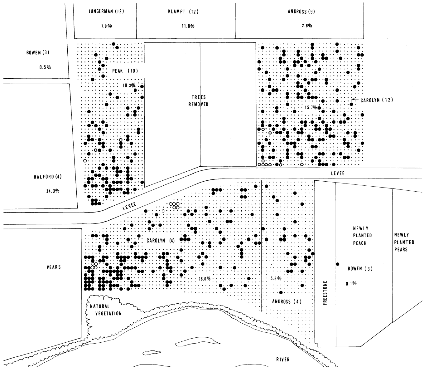
Fig. 2. Peach yellow leaf roll (PYLR) in peach orchards near a pear orchard in Yuba County, 1979. The cultivar, number of years since planting, and percent of trees with symptoms are labeled in each block. · = peach trees without PYLR symptoms, ● = trees with PYLR, ○ = recently removed trees.

b Numerator is number of blocks with one or more trees with PYLR; denominator is total number of blocks of same age.