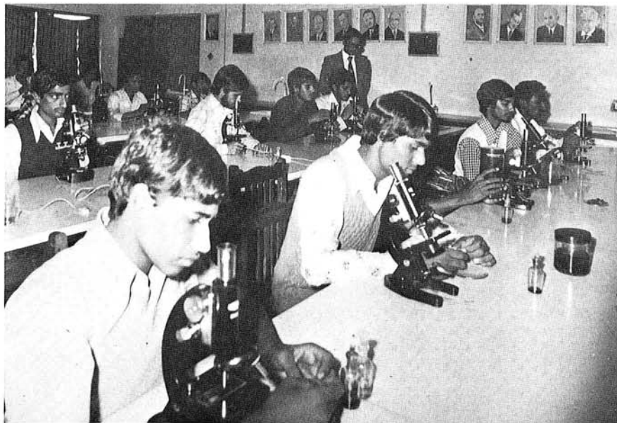
An undergraduate laboratory session in progress.