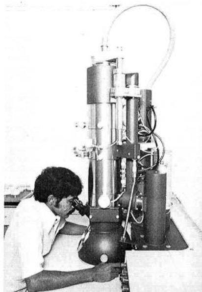
Many plant pathology departments have sophisticated equipment, such as the electron microscope, but maintenance is often difficult.

A weakness existing in many countries is the reluctance of administrators to recognize good teachers, mainly out of fear that this will make the other teachers unhappy. I very definitely do not