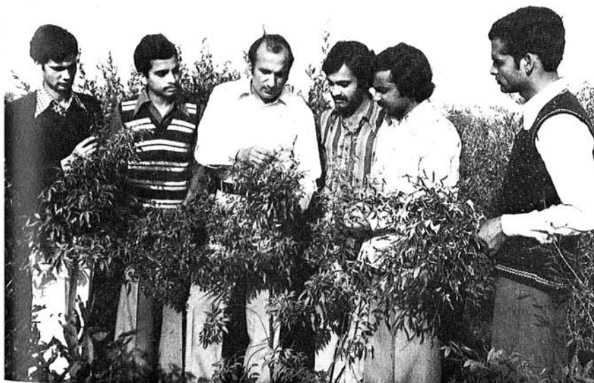
A postgraduate class in a field of pigeon pea ( Cajanus cajan ). More field sessions are needed at both the undergraduate and the postgraduate levels.

Postgraduate teaching needs to be evaluated very critically, and radical changes in attitudes and in organization of some departments are required. The number of courses should be reduced by merging those with overlapping content. I have no doubts that most departments could cover the broad subject of plant pathology in about 12-14 courses, including those offered by specialists; eg, biochemical plant pathology could be taught only in departments with the