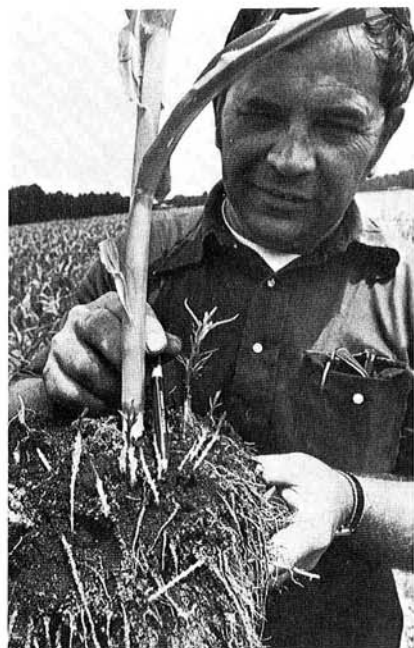
Fig. 3. Witchweed parasitization of corn plant roots.

Coincidental with the identification of strigol, Egley and Dale (2) showed that ethylene gas was highly effective in inducing germination of preconditioned witchweed seeds. (As used here, preconditioning refers to a physiological condition in which mandatory temperature and moisture regimes have been met and the seed will germinate in response to a chemical stimulant.) With this discovery, major effort was devoted to determining the potential for practical use of ethylene (3) and to developing the methodology for field application. It was established that ethylene injected 15-20 cm into the soil at the rate of 1.6 kg/ha during May through July would diffuse more than 1 m from the point of injection and initiate the suicidal germination of all preconditioned seeds in this zone. Special equipment, similar to that for applying anhydrous ammonia, was designed for field application of ethylene. A single