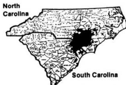
Fig. 4. Under witchweed quarantine, movement of regulated articles from shaded areas into or through unshaded areas is restricted. Regulation is total for completely shaded counties and partial for incompletely shaded counties.

application, properly done, can reduce the witchweed seed population of a site by greater than 90%, and three applications in sequential years, along with an escape plant control program, can eradicate witchweed. An ethylene treatment costs less than $25/ha, but because funds are