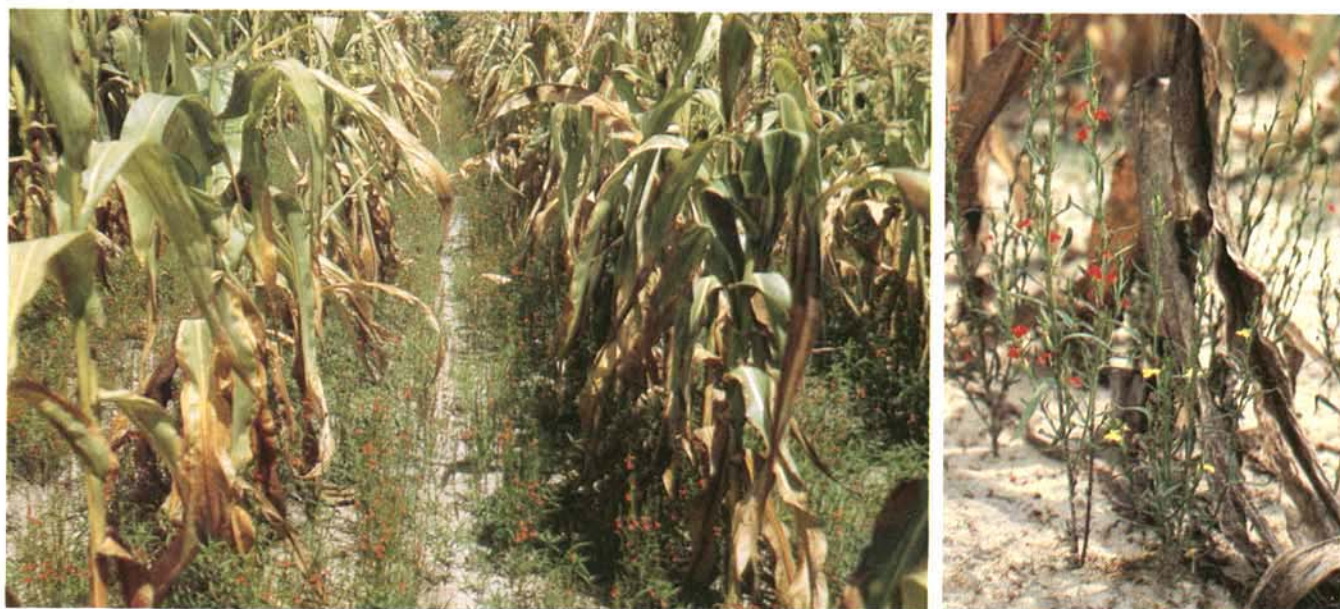
Fig. 1. Witchweed infestation of cornfield. (Right) Close-up of the parasitic weed.

This article is in the public domain and not copyrightable. It may be freely reprinted with customary crediting of the source. The American Phytopathological Society, 1981.