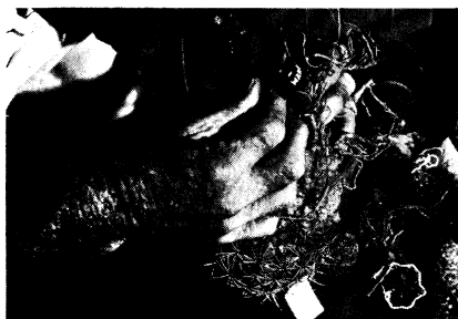
Fig. 1. Newly arrived germlasm is inspected for pests by APHIS personnel.

Vegetative propagules. This group includes cuttings, budwood, or plants of most tree fruits (including apples, pears, peaches, and plums), grapes, potato, sweet potato, and some ornamental species. These materials are inspected on arrival and established and held under quarantine at the Plant Introduction Station, Glenn Dale, Maryland. The potato and sweet potato introductions may remain in quarantine for 18–30 months, whereas most of the tree fruits require 4–6 years. Citrus must be