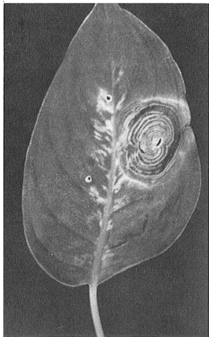
Fig. 3. Leaf spot of Dieffenbachia maculata 'Perfection' from an artificial inoculation with Fusarium solani .

with 6 kg of Osmocote (14-14-14, slow release fertilizer; Sierra Chemical Co., Milpitas, CA), 1 kg of Perk (micronutrient source; Estech, Inc., Chicago, IL 60604), and 4 kg of dolomite per cubic meter of medium. Throughout this study, plants were watered twice a week by hand and grown on raised benches in a glasshouse with about 10.8 klux of natural light.