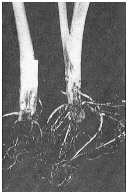
Fig. 2. Naturally occurring cutting end rot of Dieffenbachia maculata 'Perfection' incited by Fusarium solani .

The pathogenicity of the suspect pathogen to dieffenbachia was tested on D. maculata 'Perfection' plants grown from cuttings removed from pathogen-free plants produced through tissue culture. Cuttings were rooted in steam-sterilized potting medium (Canadian peat, cypress shavings, and pine bark; 2:1:1 by volume), which was amended