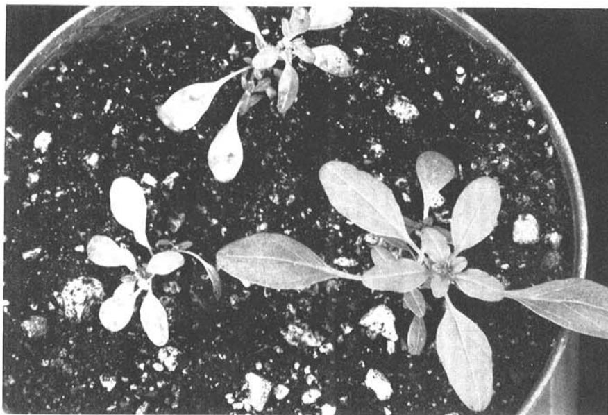
Fig. 3. Two Amaranthus albus seedlings infected from seed with an isolate of alfalfa mosaic virus (AMV-CF) from A. albus showing stunting and yellow mosaic symptoms; (lower right) healthy seedling.