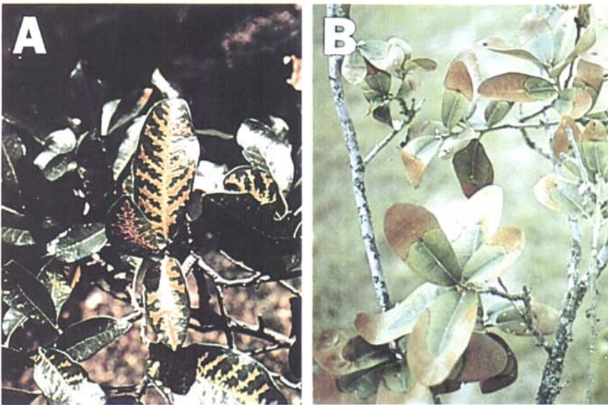
Fig. 3. Common oak wilt symptoms on live oak in Texas. Both (A) veinal necrosis and (B) tipburn are found, with the former being the most consistent.

defoliated trees appeared gray. Individual polygons were difficult to delineate in large areas of concentrated mortality. Also, the density of susceptible trees was often different from one area of mortality to the next. The total area of mortality, and number and sizes of individual polygons, therefore varied between photo missions.