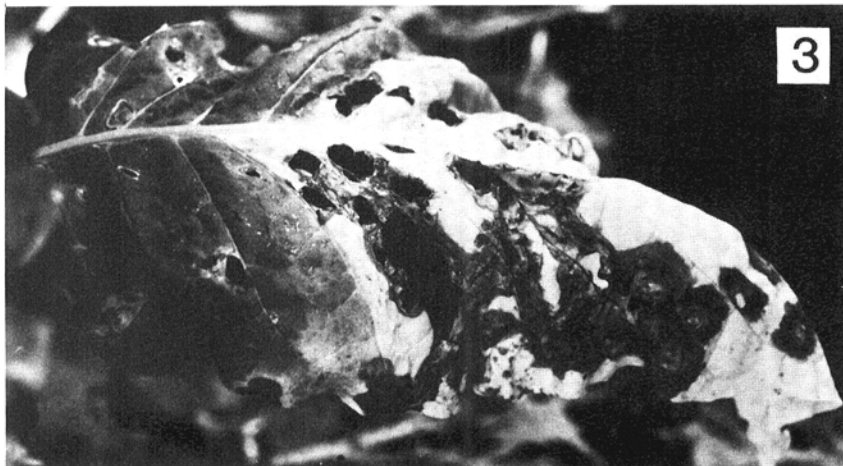
Figs. 1-3. Signs and symptoms of leaf spot of flue-cured tobacco caused by Rhizoctonia solani . (1) Hymenial layer on the underside of a Hicks tobacco leaf grown in the greenhouse. About 0.5 g of rice grains colonized by R. solani had been placed in the soil 4 cm from the base of the plant 5 days before photography. (2) Stages in symptom development ranging from small spots to shot-hole lesions. (3) Severe infection of flue-cured tobacco in the field.