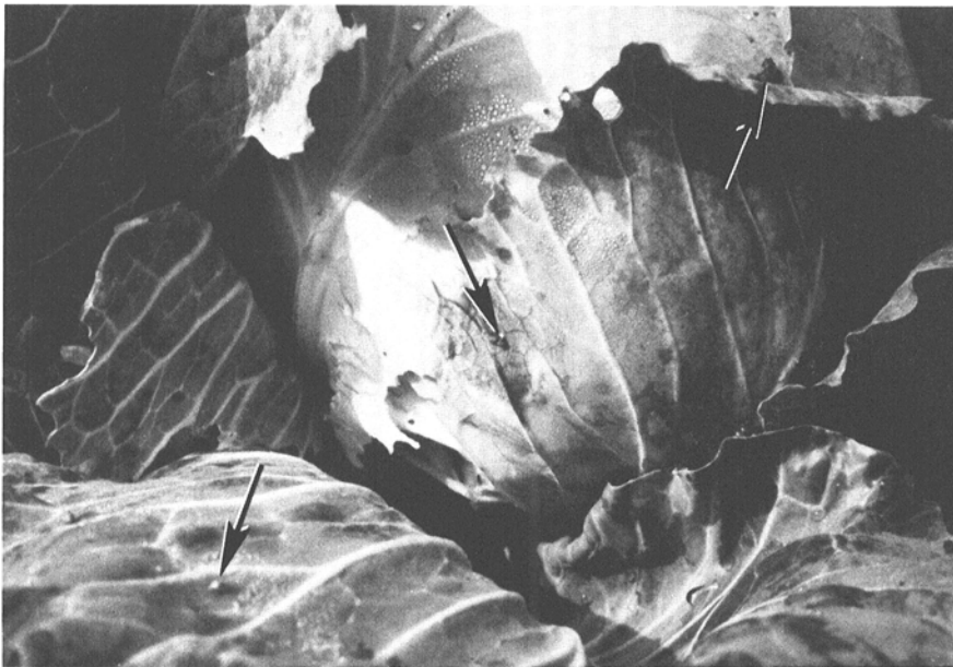
Fig. 3. Dislodged achenes and male flowers adhering to cabbage leaves (arrows) in the field. Center arrow points to a dislodged male flower in the middle of a lesion caused by Sclerotinia sclerotiorum .