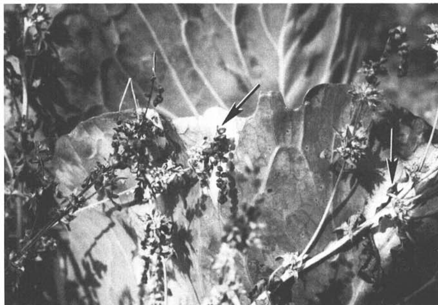
Fig. 2. Cabbage plants infected with Sclerotinia sclerotiorum where contact occurred (arrows) with previously infected common ragweed plants in the field.

Excised leaves from 8-wk-old cabbage plants were placed in plastic petri plates (100 × 15 mm) on moistened Whatman No. 1 filter paper. Ragweed plant parts and bean blossoms were inoculated by placing them directly over apothecia produced in petri dishes in controlled-environment chambers (1). When the petri dish tops were removed, the ascospores were forcibly discharged into the air surrounding the ragweed or bean tissues (7). The inoculated plant parts were then placed individually on single cabbage leaves in petri plates. Plates were opened in a mist chamber, and a thin film of moisture was allowed to form on the surface of the plant parts. The plates were then covered, sealed with Parafilm, and incubated at 22 C. The ragweed parts used in this study were pollen-producing staminate involucres, senescing staminate involucres, senescent staminate involucres, ragweed pollen clumps, green achenes, mature achenes, green ragweed leaves, and green ragweed leaves + snap bean