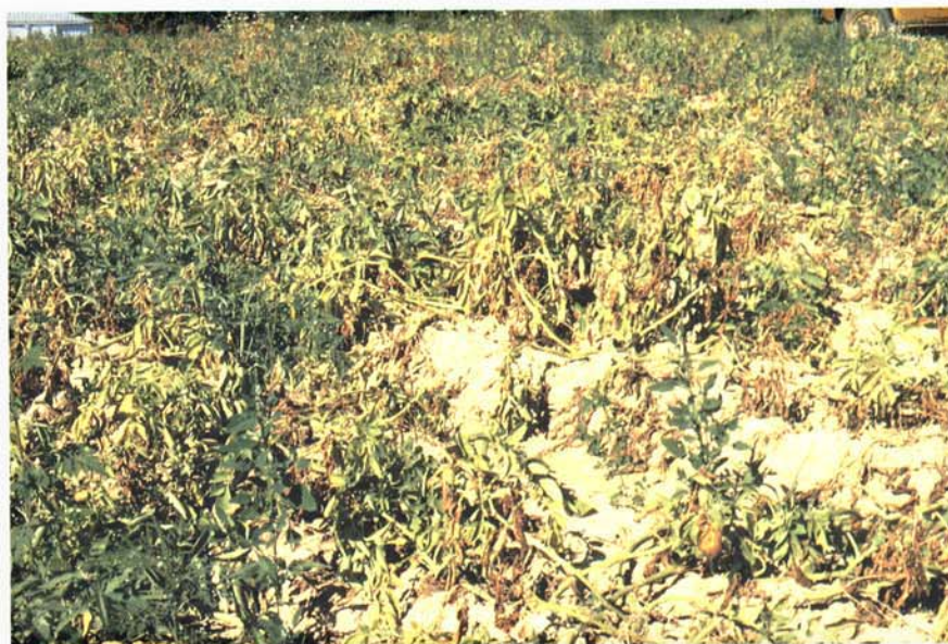
Fig. 2. Symptoms of severe potato early dying in an Ohio field of cv. Norchip in early August.

hyphae within infected tissues. They also differ in temperature sensitivity. V. albo-atrum grows optimally at about 21 C, whereas optimal growth of some V. dahliae isolates occurs as high as 27 C. V. dahliae is the more widespread species and predominates in the north central states and the Pacific Northwest where average summer temperatures frequently exceed 25 C. V. albo-atrum , alone or with V. dahliae , is involved in PED in cooler production areas such as Maine, the Red River Valley, and the winter production areas of Florida where average temperatures do not normally exceed 21–24 C during the growing season.