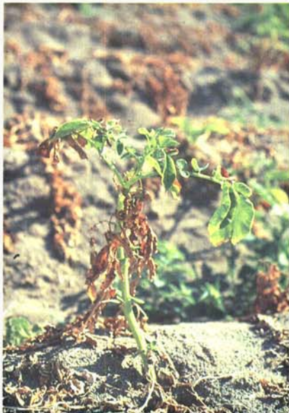
Fig. 3. Potato early dying symptoms in cv. Norgold Russet infected with Erwinia carotovora subsp. carotovora .

Management practices that modify the rate of stem colonization by V. dahliae or increase the host's tolerance to colonization also may be useful control measures for PED. In Idaho, irrigation and plant nutrition have been found to correlate significantly with the severity of PED and with colonization of potato stem tissues by V. dahliae (4). In these studies, disease was more severe with gravity-flow furrow irrigation than with sprinkler irrigation. Although it is not clear how the method of irrigation affects PED, a relationship with nitrogen availability has been suggested (3,4). With furrow irrigation, nitrogen often accumulates within the upper 7.5–15.0 cm of the soil profile. In contrast, nitrogen may be more uniformly distributed throughout the soil with sprinkler irrigation. When nitrogen is less available to the plant's root system because of leaching or poor distribution, disease incidence and