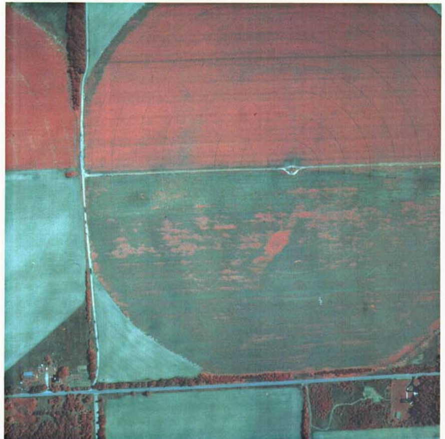
Fig. 4. Aerial infrared photograph of a 60-ha potato field with a history of severe potato early dying (red indicates healthy vegetation). Metam-sodium (470 L/ha) had been applied through a center-pivot irrigation system the previous fall to the upper half of the field.