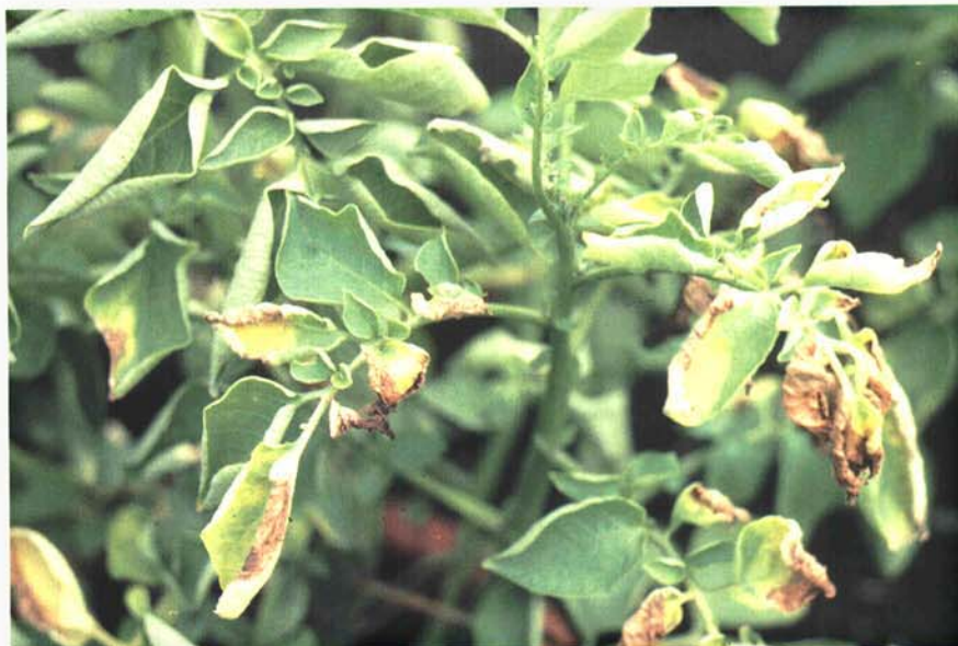
Fig. 1. Symptoms of potato early dying in cv. Superior infected with Verticillium dahliae .