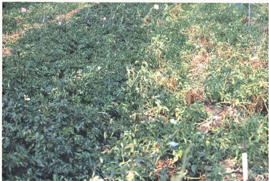
Fig. 6. Comparison of Verticillium -resistant potato clone A66107-51 (left) with susceptible cultivar Russet Burbank (right).