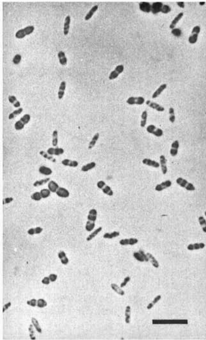
Fig. 2. Conidia of Fusarium tabacinum from a 10-day-old culture on potato-dextrose agar. Scale bar = 25 \mu m.

was placed on the stem after removing the epidermis, then the inoculation site was wrapped with sterile, moistened cotton wool and covered with Parafilm. In the second and third inoculation methods, the fungus was grown in 500-ml flasks containing 200 ml of casein hydrolysate and incubated in a shaker at 25 C for 8 days. The resulting conidial suspension ( 10^6 /ml) was sprayed onto sunflower leaves or distributed over the soil surface (80 ml/pot). The fourth inoculation method consisted of immersing the roots in the conidial suspension for 45 min, then transplanting plants in the pots. Controls consisted of plants inoculated with an agar disk or sterile distilled water. Inoculated plants were incubated in the greenhouse ( 22 \pm 2 C) for 25 days, and development of symptoms was recorded. Pathogenicity tests on other plants, tobacco ( Nicotiana tabacum L. cv. BC 60) and basil ( Ocimum basilicum L.), reported as hosts of the fungus, were carried out.