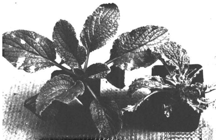
Fig. 1. Symptoms induced in Borago officinalis 2 mo after mechanical inoculation with sap from Cucurbita pepo inoculated with sap from field-infected borage. (Left) Healthy control and (right) inoculated plants.