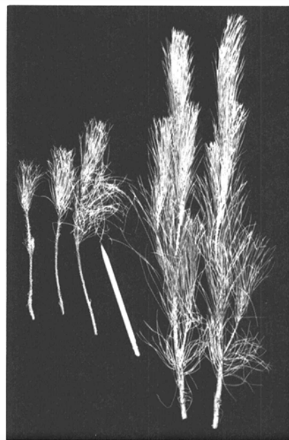
Fig. 2. Sprayed and unsprayed red pine seedlings harvested at ground line after 3 yr. The two large seedlings on the right were protected from Lophodermium seditiosum for 3 yr by three applications of benomyl per year; the three small seedlings on the left were not protected by a fungicide.