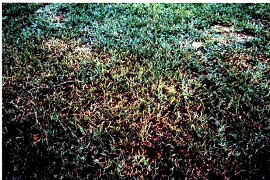
Fig. 1. Thinning of St. Augustinegrass lawn canopy and chlorosis and necrosis of the leaf tissue caused by root infection by Gaeumannomyces graminis var. graminis .

Pathogenicity tests. All St. Augustinegrass plants grown in the topsoil mix with G. g. graminis isolate FL-39-infested oat kernels or FL-163-infested ryegrass kernels had an average root rot rating