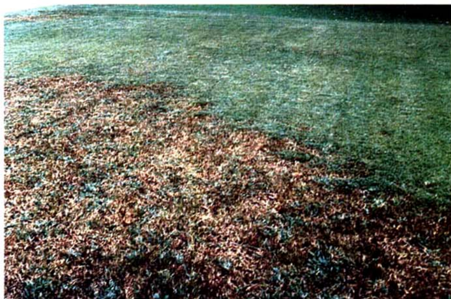
Fig. 2. Characteristic patch symptom observed on St. Augustinegrass lawn. Gaeumannomyces graminis var. graminis was isolated from the rotted roots.