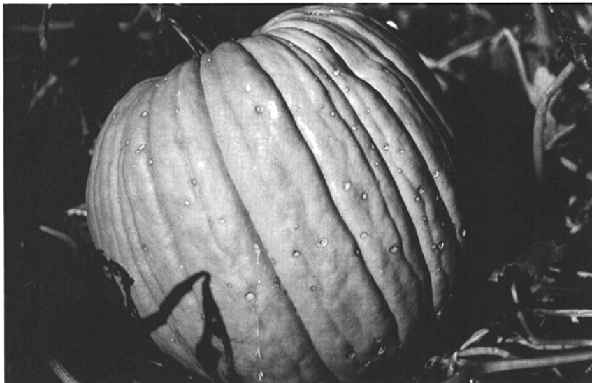
Fig. 2. Pumpkin fruit covered with the preharvest type 1 lesions of Fusarium fruit rot.