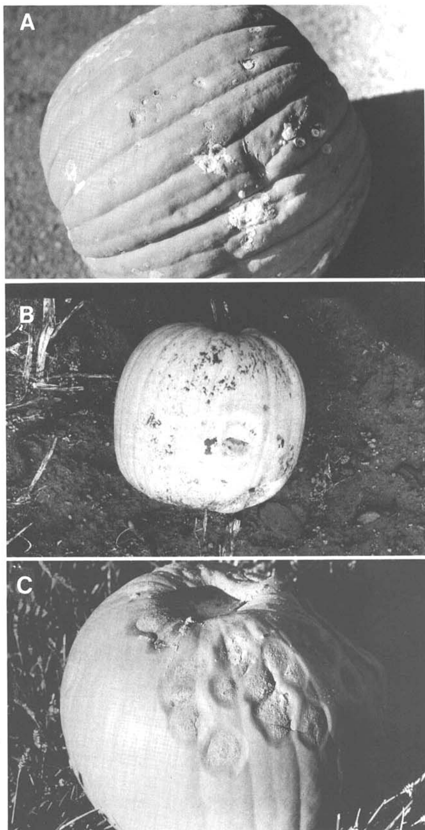
Fig. 3. Postharvest symptoms of type 2 lesions of Fusarium fruit rot on cultivar Howden pumpkins in Connecticut (A and B) and Indiana (C). (A) Lesions with profuse aerial mycelium on a fruit that also has type 1 lesions. (B) Soft, sunken, water-soaked lesion without aerial mycelium. (C) Soft, sunken lesion with aerial mycelium and sporulation (courtesy K. Rane).

Both methods of inoculation were effective in reproducing lesions from the Fusarium spp. Species of F. acuminatum , F. graminearum , F. avenaceum , and F. equiseti , and the F. solani culture from Indiana all expanded from the original wound and produced lesions. The fungi were readily reisolated from the lesions. F. acuminatum commonly caused a type 1 lesion that expanded approximately 0 to 1.0 cm over a period of 4 weeks. Inoculations with F. graminearum , F. equiseti , and F. avenaceum produced the type 2 lesion. Lesions caused by F. equiseti frequently produced a water-soaked appearance, which was one of the field symptoms (Fig 3B). The lesions caused by F. equiseti expanded approximately 2 to 5 cm over 4 weeks, as opposed to those caused by F. graminearum or F. avenaceum , which expanded 1 to 4 cm. F. graminearum tended to produce lesions with aerial mycelium more than F. equiseti or F. avenaceum . When aerial mycelium was present on F. equiseti -inoculated lesions, it appeared as zonal rings filled with macroconidia. The Indiana isolate of F. solani produced soft, sunken lesions with dark, sporulating centers, which were very similar to the symptoms observed in the field (Fig 3C). The Connecticut isolate of